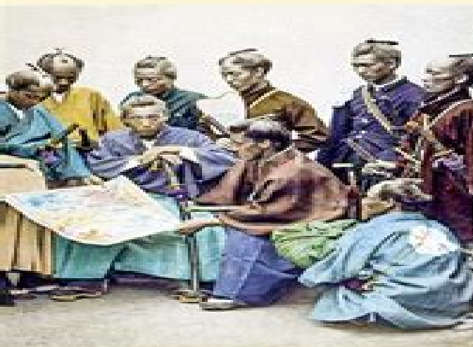
Samurai of the Satsuma domain