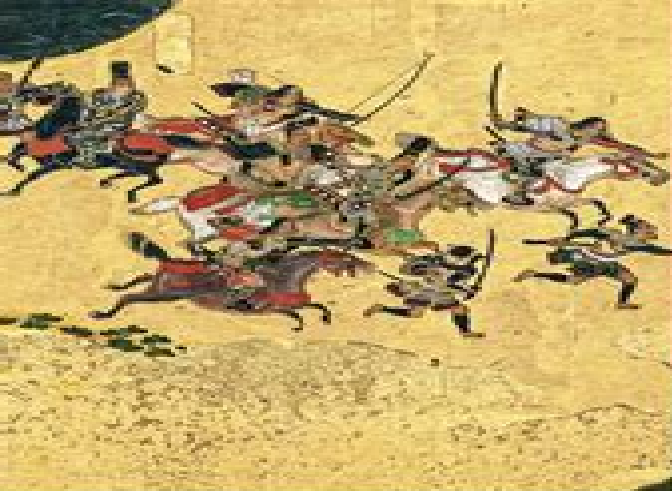
The Rebellions of the Hogen and Heiji Eras