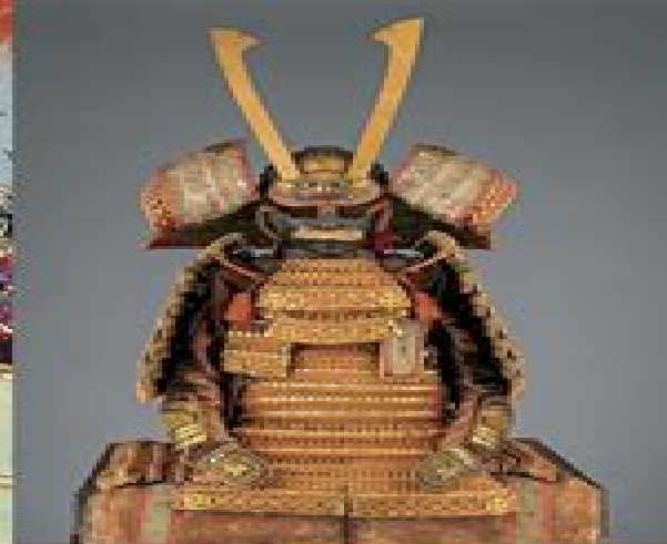
Yoroi Style Armor