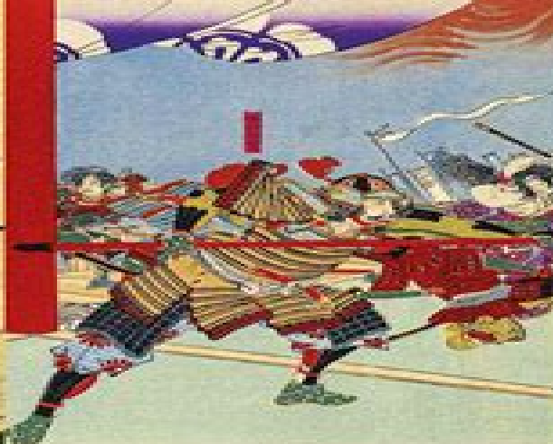
The Honno-ji Incident (1582)