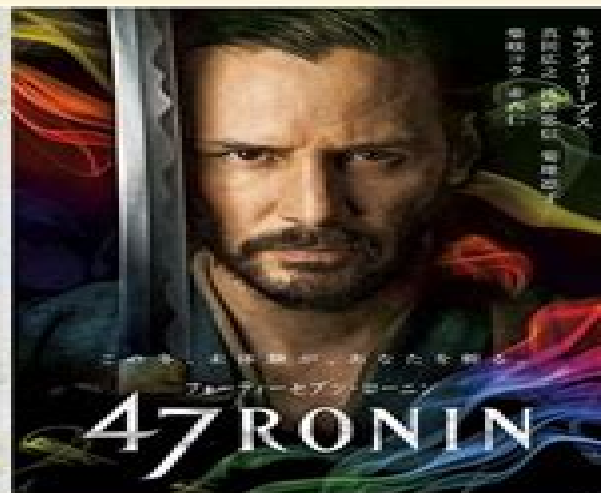
47 Ronin (2013) starring Keanu Reeves