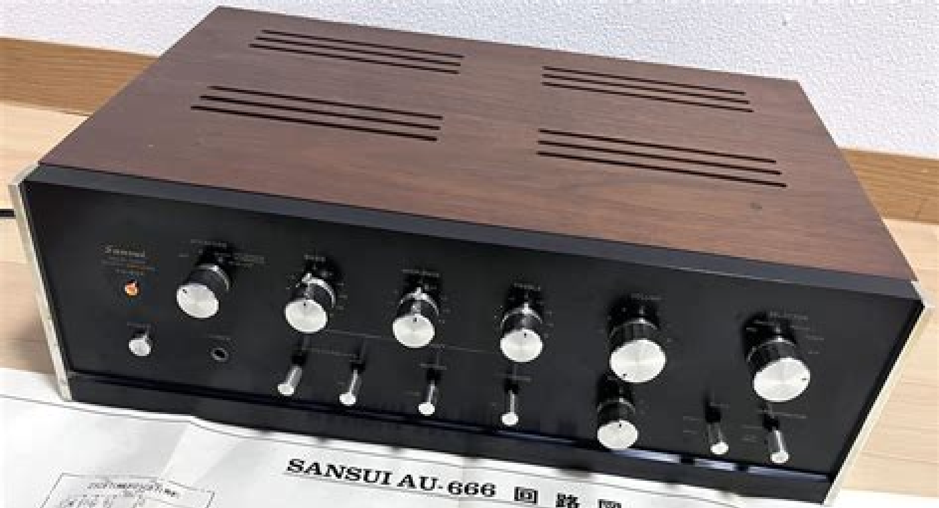
SANSUI AU-666 回路図