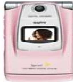
Cherry Blossom Pink