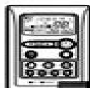
Wired Remote Controller (Option)