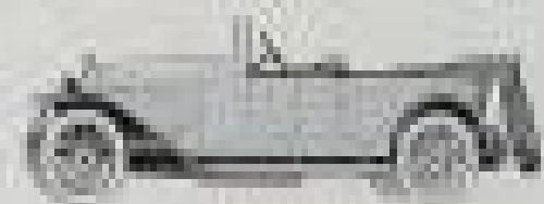
REAR-ENGINE CONVERTIBLE A car designed for maximum open-air driving, featuring a rear-engine layout and a folding convertible top.