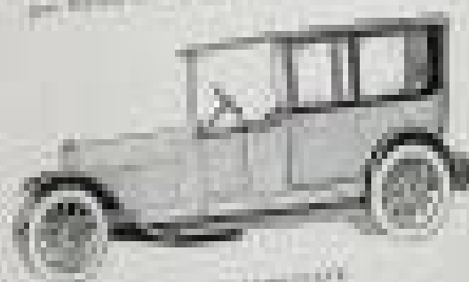
SEDAN This model features a fixed roof and side windows, designed for a more formal and protected driving experience.