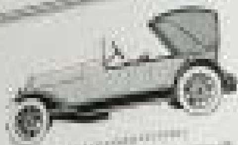
REAR-ENGINE CONVERTIBLE The latest in car design, with the engine at the rear, front-wheel drive, and a folding convertible top.