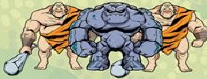
The Legend of the Giants