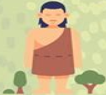
The Legend of Arogo