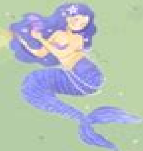
The Legend of the Mermaid