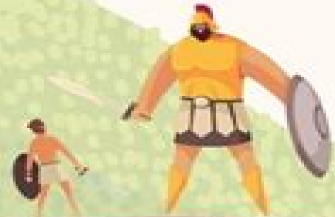
The Legend of the Battle of the Gods