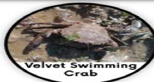
Velvet Swimming Crab