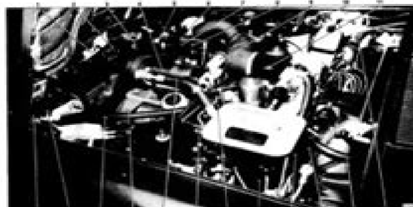
Fig. 1B General view of engine compartment - low gas