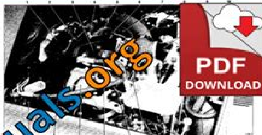
Fig. 1B General view of engine compartment - dry gas

5. To avoid damage to the rear of the engine compartment, care should be taken not to over-tighten the bolts at the rear of the engine compartment. The rear of the engine compartment is the rear of the engine compartment.