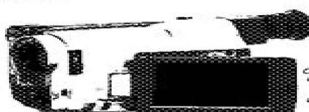
Photo : CCD-TRV53

US Model CCD-TRV32/TRV52/TRV53/ TRV312/TRV512(NTSC)