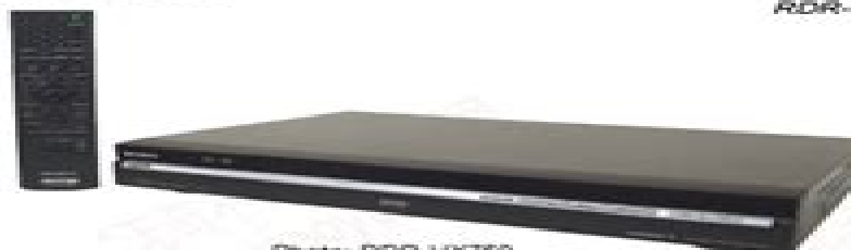
Photo: RDR-HX750 RMT-D247P