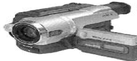
Photo : CCD-TRV408E

AEP Model UK Model East European Model North European Model Russian Model CCD-TRV108E/TRV208E/TRV408E E Model Australian Model Hong Kong Model Tourist Model CCD-TRV107E/TRV408E Chinese Model CCD-TRV107E