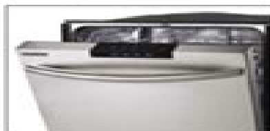
Dishwasher Sound Insulation: Samsung provides one of the quietest dishwashers in its class.