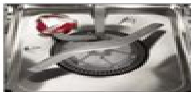
Samsung's Storm Wash has a powerful built-in nozzle, a tilted racking system and ample height for the messiest pots.