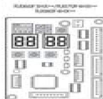
Display of the external unit