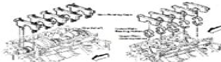
Some of the main engine components

The block, highlighted at right in grey, is a heavy metal casting, usually cast iron or aluminum, which holds the lower parts of the engine together and in place. The block assembly consists of the block , crankshaft , main bearings and caps , connecting rods , pistons , and other components, and is referred to as the bottom end . The block may also house the camshaft , oil pump , and other parts. The block is machined with passages for oil circulation called oil galleries (not shown) and for coolant circulation called water jackets .