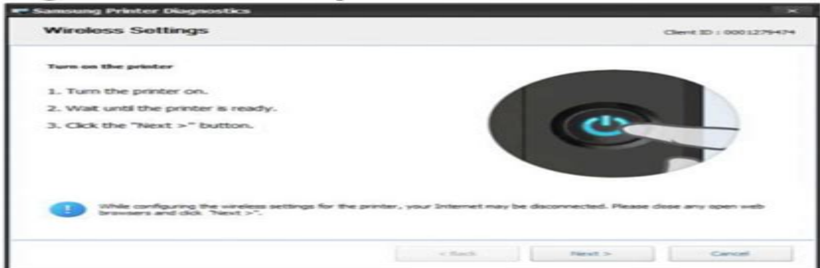
Figure : Turn the printer on