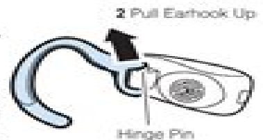
2 Pull Earhook Up