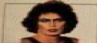
Rocky Horror (page 2)