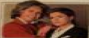
The Last Best Year (right)