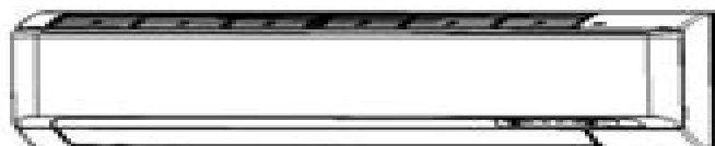
SAP - K186ST