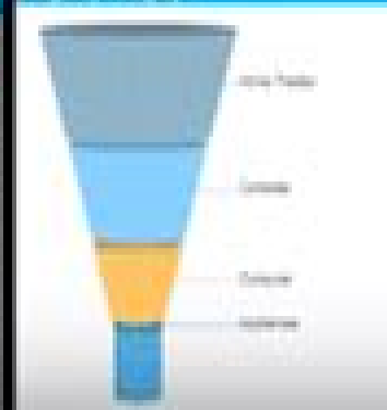
Margin by Category