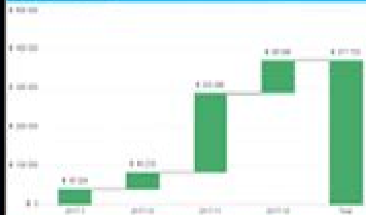
Margin over Month Economic