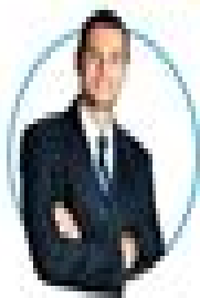
E2E Logistic User