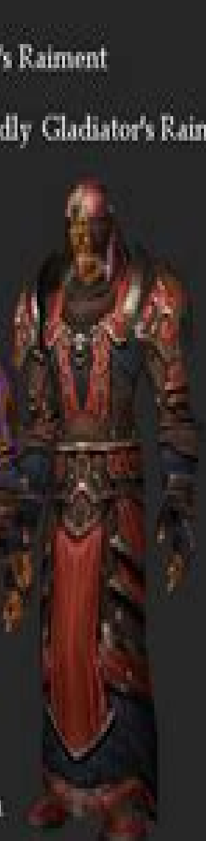
Season 5 high