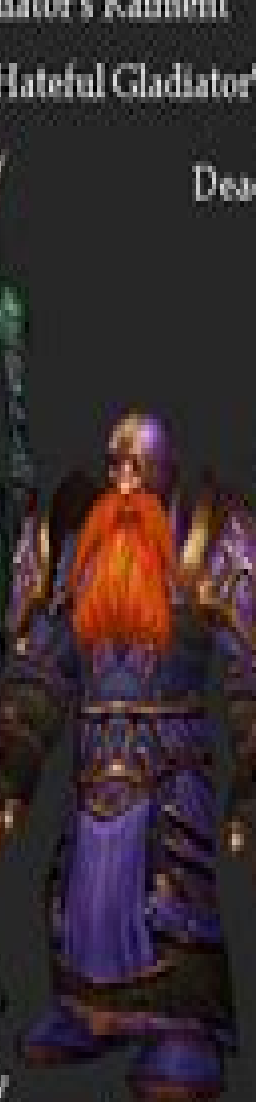
Season 5 medium