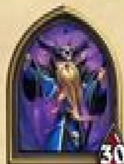
Gothik the Harvester