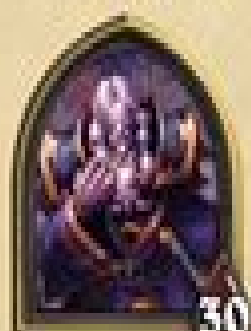
Noth the Plaguebringer