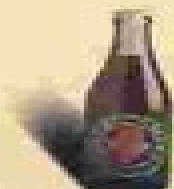
WHEAT BEER + Austria