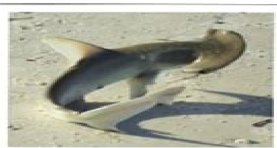
Whale Shark Threatened