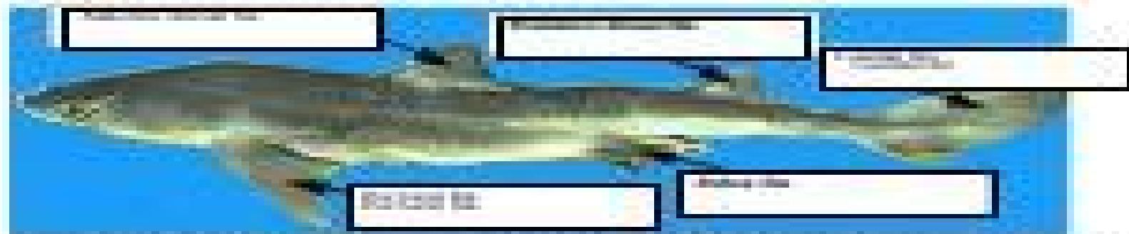
Figure 1: A photograph of a pine eel, a species of eel found in the Atlantic Ocean.

The pine eel is a species of eel found in the Atlantic Ocean. It is a long, slender fish with a mottled brown and yellowish-brown pattern on its body. The eel is shown swimming towards the left. The background is a solid blue color.