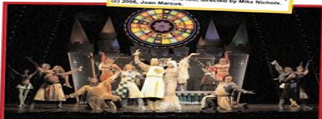
The cast of the National Tour of MONTY PYTHON'S SPAMALOT, with book and lyrics by Eric Idle, music by John Du Prez and Eric Idle, directed by Mike Nichols.

THEATRE UNDER THE STARS 800 BAGBY, SUITE 200 HOUSTON, TEXAS 77002