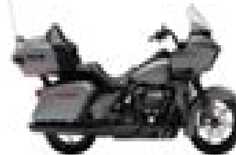
ROAD GLIDE® LIMITED FL 120