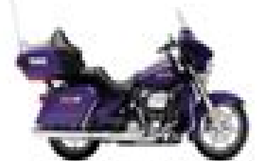
ULTRA LIMITED FL 120