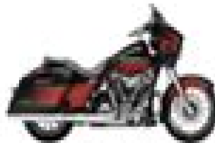
CVO® STREET GLIDE® FL 120S