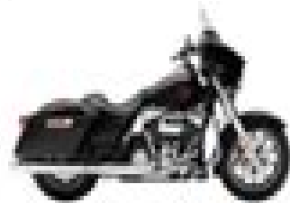
ELECTRA-GLIDE® STANDARD FL 121