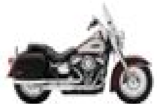
HERITAGE GLIDE® FL 120