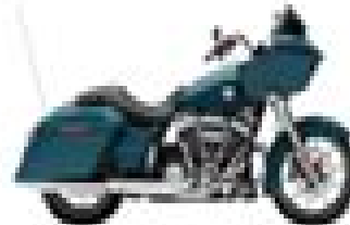
ROAD GLIDE® SPECIAL FL 120S