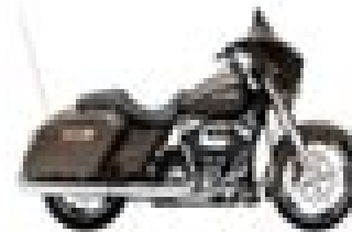
STREET GLIDE® FL 120