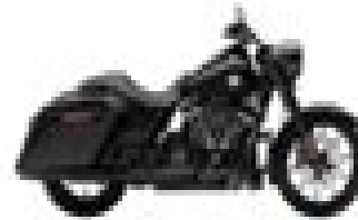
ROAD KING® SPECIAL FL 120S