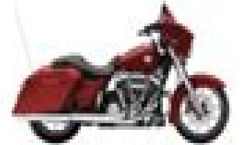
STREET GLIDE® SPECIAL FL 120S