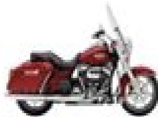
ROAD KING® FL 120