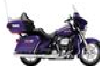
ULTRA LIMITED® FL106