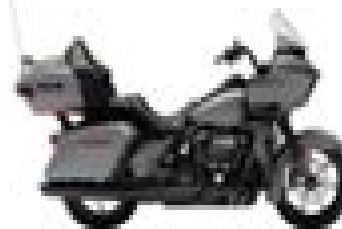
ROAD GLIDE® LIMITED FL104L