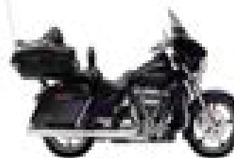
CVO® LIMITED FL106C

©2020 Harley-Davidson, Inc. All rights reserved. Harley-Davidson is a registered trademark of Harley-Davidson, Inc. All other trademarks are the property of their respective owners.