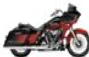
CVO® ROAD GLIDE® FL104C