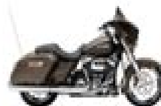
STREET GLIDE® FL103