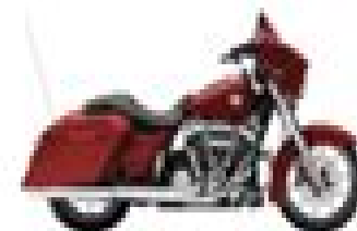
STREET GLIDE® SPECIAL FL103S