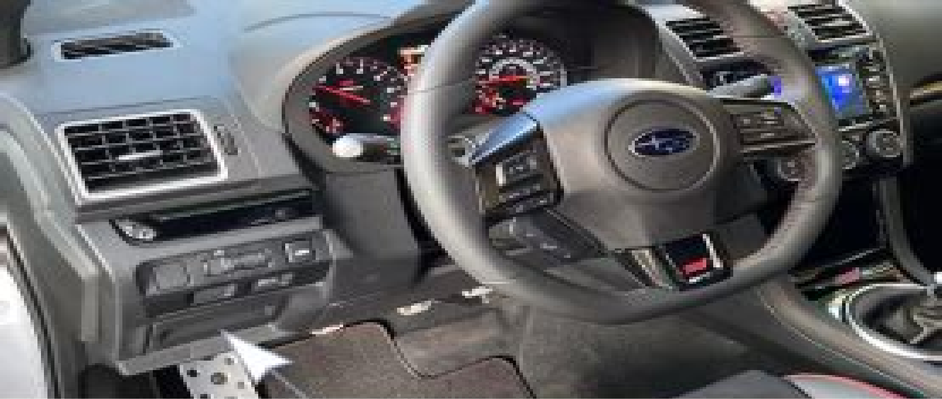
Instrument Panel Fuse Block