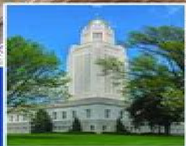
Nebraska State Capitol Lincoln, Nebraska