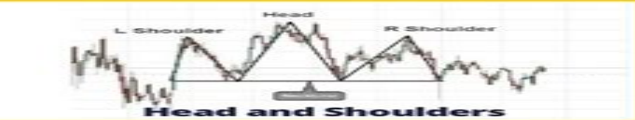
Head and Shoulders