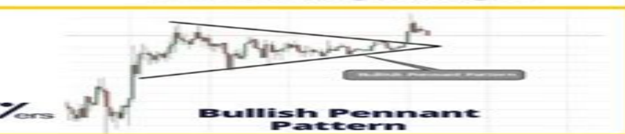
Bullish Pennant Pattern