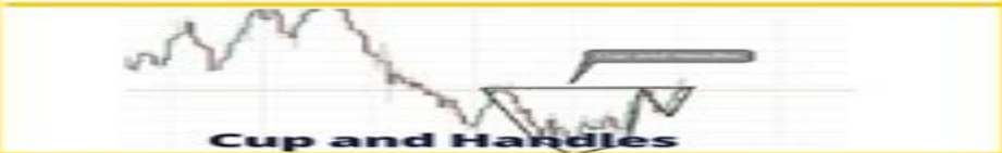
Cup and Handles