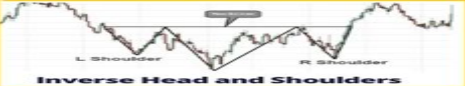
Inverse Head and Shoulders