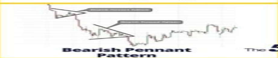
Bearish Pennant Pattern