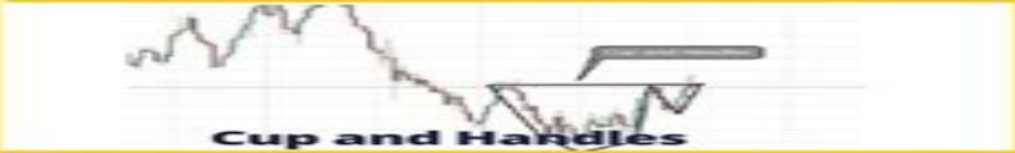
Cup and Handles