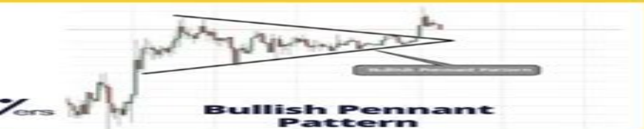
Bullish Pennant Pattern