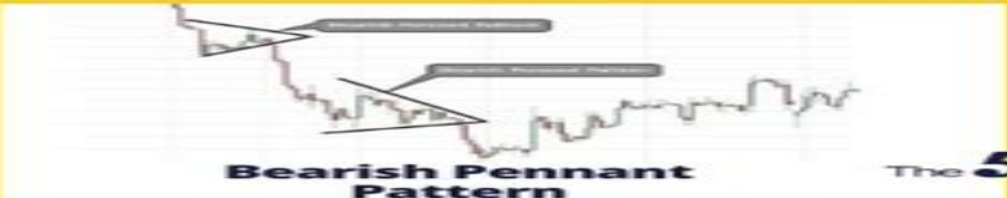
Bearish Pennant Pattern