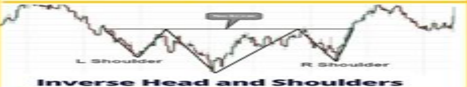
Inverse Head and Shoulders