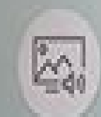
Picture and Sound