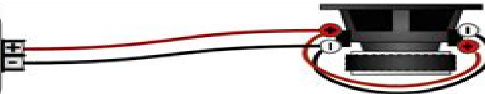
2 x 2 ohm dual voice coil in parallel = 1 ohm