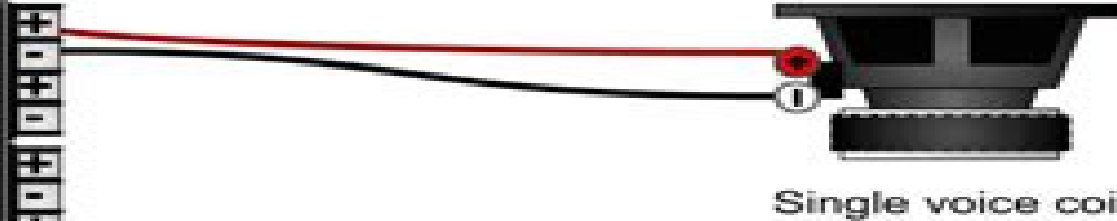
Single voice coil