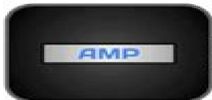
1 ohm stable mono bass amp

Maximum amp power: A DVC subwoofer can be used to get the maximum power from a 1 ohm stable amp by wiring two 2 ohm voice coils as a 1 ohm load.