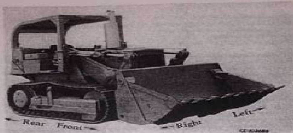
FIG. 1 — Model 175C with Multi-Purpose Bucket