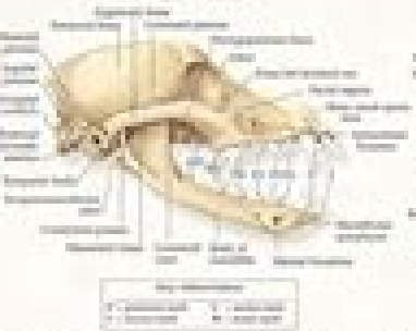
Skull Lateral view

Key abbreviations: C = Cervical T = Thoracic L = Lumbar S = Sacral Co = Coccygeal