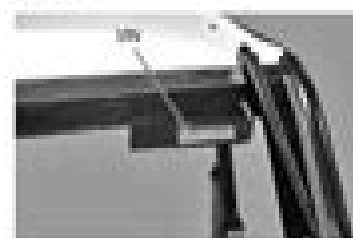
Fig. 1 VIN Location

The VIN is located on the driver side near the top of the windshield.