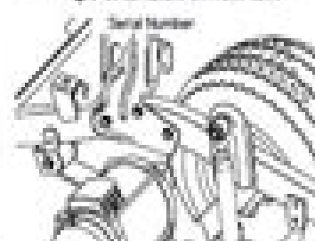
Fig. 4 Serial Number on Rear Frame