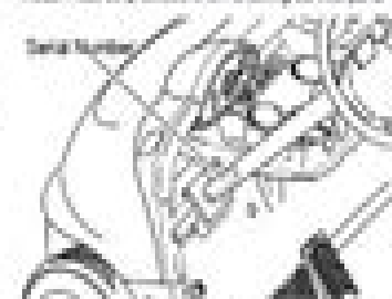
Fig. 2 Serial Number Location on Steering Column

In order to obtain correct components for the vehicle, the manufacture date code, serial number and vehicle model must be provided when ordering service parts.