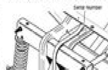
Fig. 3 Serial Number on Front Frame