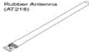
Rubber Antenna (AT218)