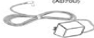
AC Adapter (AD70U)