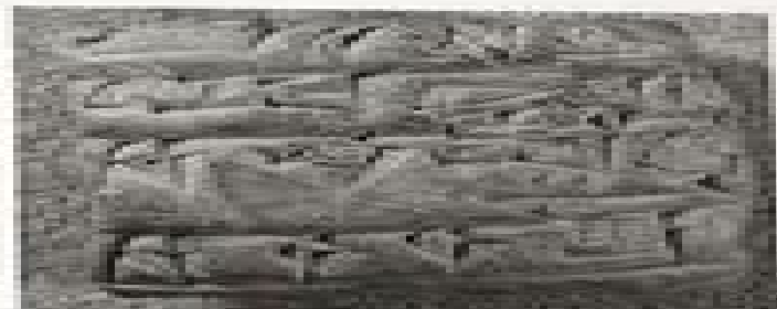
FIGURE 2.5.1 Archival letter from the 25th century BC, ordering the delivery of some wool (BM 1254, inv. no. 1254).