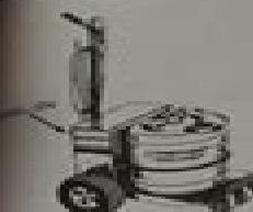
25 Gallon Gas