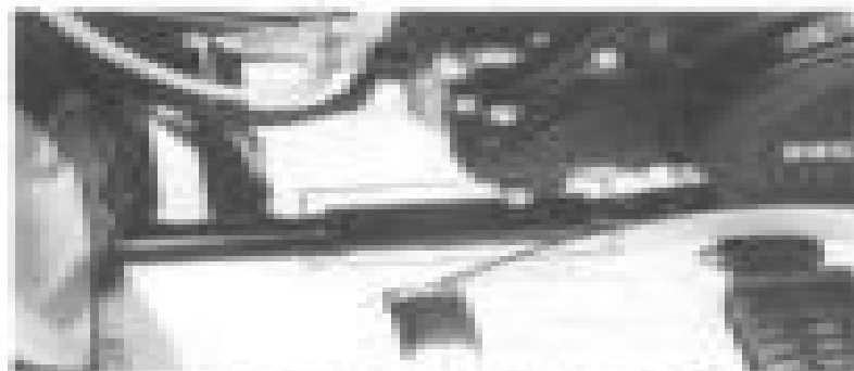
The frame serial number is stamped on the frame left side.