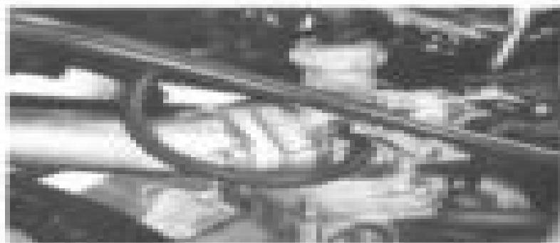
The cylinder identification number is on the left side of the cylinder cover left side.