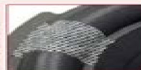
3-layer fibre woven radial surround: an extremely durable and high-performance radial surround

The whole range of new Pioneer subs is outfitted with a patent-pending 3-layer Fibre Woven Radial Surround design. The surround consists of two outer layers (rubber for the TS-W15000SPL) and one inner layer of interwoven fibre (Aramid fibre for the TS-W15000SPL) with a honeycomb weave for even distribution throughout the surround material. This eliminates weak points and improves the high power capability for an extremely durable and resilient surround that resists puckering, even under the extreme power conditions of SPL competitions.