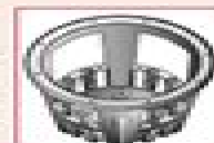
Aluminium die-cast basket structure

During high SPL levels, the motor assembly is placed under extreme pressure. So Pioneer developed an exclusive aluminium die-cast basket which securely supports the motor. This basket structure prevents any unwanted flex or vibration that can cause energy loss and reduce overall performance. A solid winner!