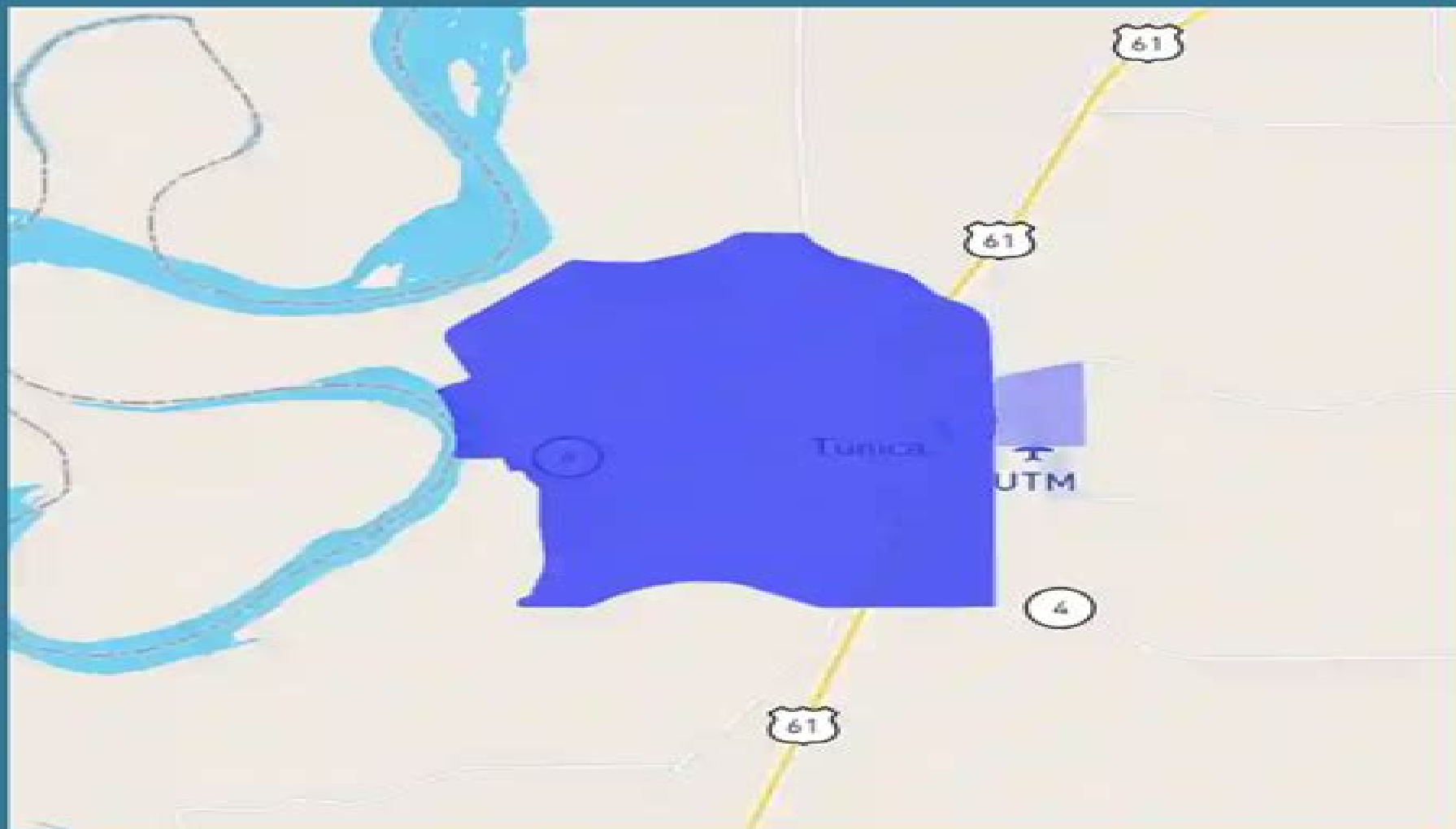
Tunica, MS Crime Map By Neighborhood

(click to see interactive crime map and report)