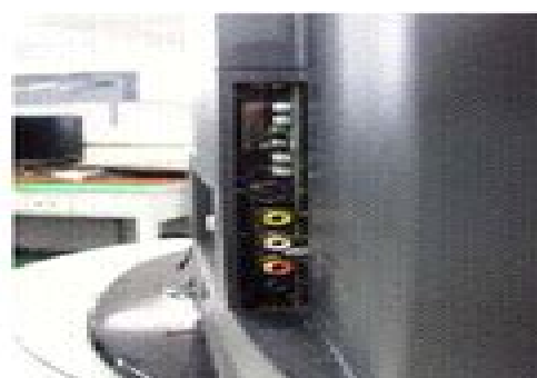
Board with missing plastic cover

Note: Consult the Samsung Service Website at ( www.service.samsungportal.com ) for the Service Manual and other information on this produ