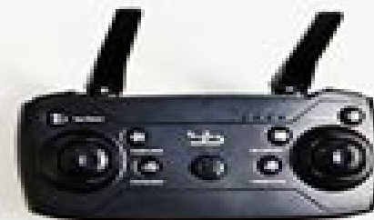
REMOTE CONTROL X1