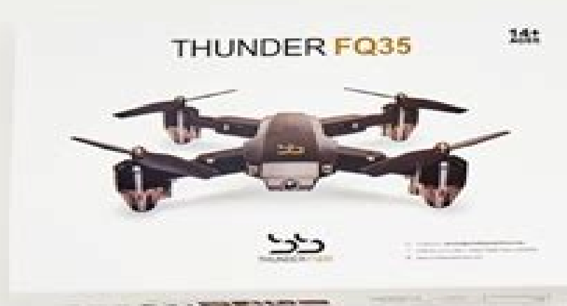
PACKING BOX X1