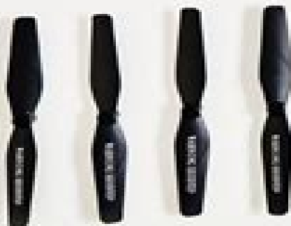
SPARE PROPELLERS X4