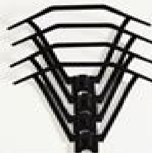
PROTECTIVE FRAME X4