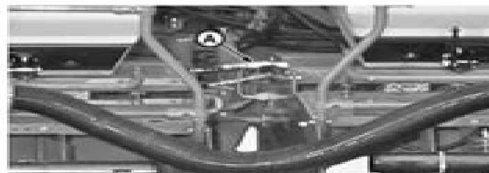
B—Air Duct Hose