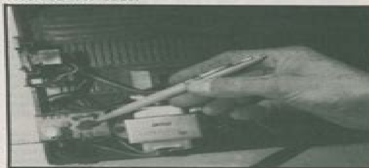
Figure 1. If there's no sound (and the speaker is OK) a good bet is burned or leaky silicon rectifier diodes in the power supply. Check with a flashlight if necessary. Replace with a one amp, two, or 2.5 amp rectifier.

A leaky diode will have a low resistance measurement in both directions. Replace the diode if you find low resistance (below 350 ohms). Now reverse the test leads and take another measurement. Install a new silicon diode if you have a low reading. A normal diode should show low ohms measurement in one direction, and infinite measurement with reversed test leads.