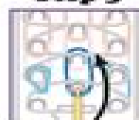
Grab the blue band on the center pin