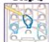
Loop the blue band straight up to the next pin