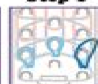
Loop the blue band straight up to the next pin

Step 7: Continue picking up and looping the bands until you reach the top of the loom. Finish the bracelet with a white extension and C-clip. (see reverse)