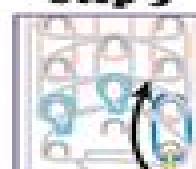
Grab the blue band on the right pin