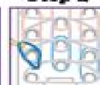
Loop the blue band straight up to the next pin