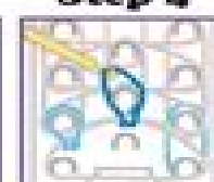
Loop the blue band straight up to the next pin