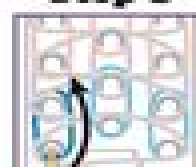
Grab the blue band on the left pin