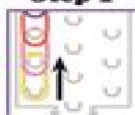
Place bands on the left row of pins