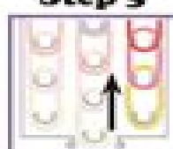
Place bands on the right row of pins

Step 4: Place white bands in triangles as shown on the diagram.