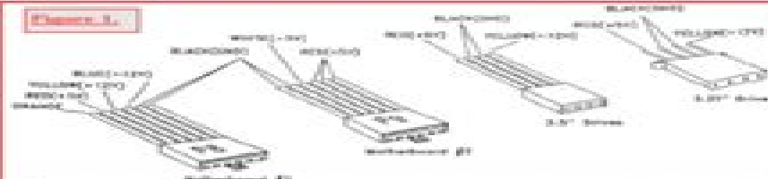
The 11.25-inch drive connection is the standard for various fan models. The south- ward connection PS and PS are identical, and can be reversed. They plug into the southward with the black leads together on the inside.

If there's no power, and you're plugged into a power strip or surge protector, the strip is probably the culprit. To test it, simply remove the PC's plug from the strip and