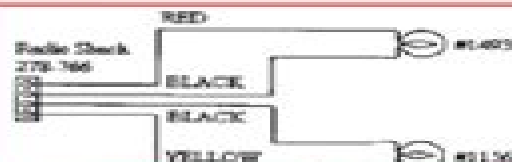
Figure 2. A. Showny land area for smaller farms in various ranges that grow rice all year long. B. Showny land area for medium and large farms in various ranges that grow rice all year long.

A typical PC power supply provides four DC output voltages: +5, +12, -5, and -12 volts. These voltages are available through four different types of connectors (Figure 1-14). The color of the wire identi-